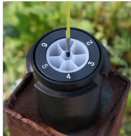
Measure water levels within the narrow channels of a Solinst CMT® System.

The 102M Mini Water Level Meter is available in 25 m and 80 ft lengths. There is the choice of the P4 or P10 Probe.