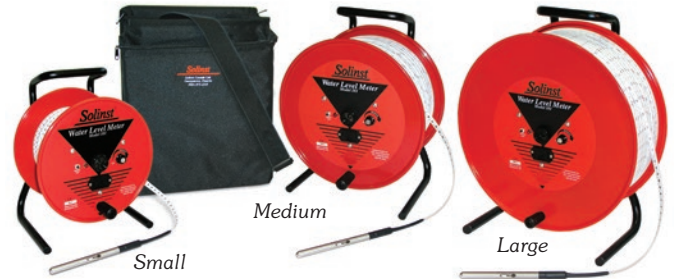
Model 101 Water Level Meter Reels

* Polyethylene tapes are only available in these lengths