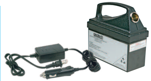
Geopump™ Modular Battery and Charger