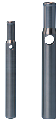
Geopump™ Tubing Weights