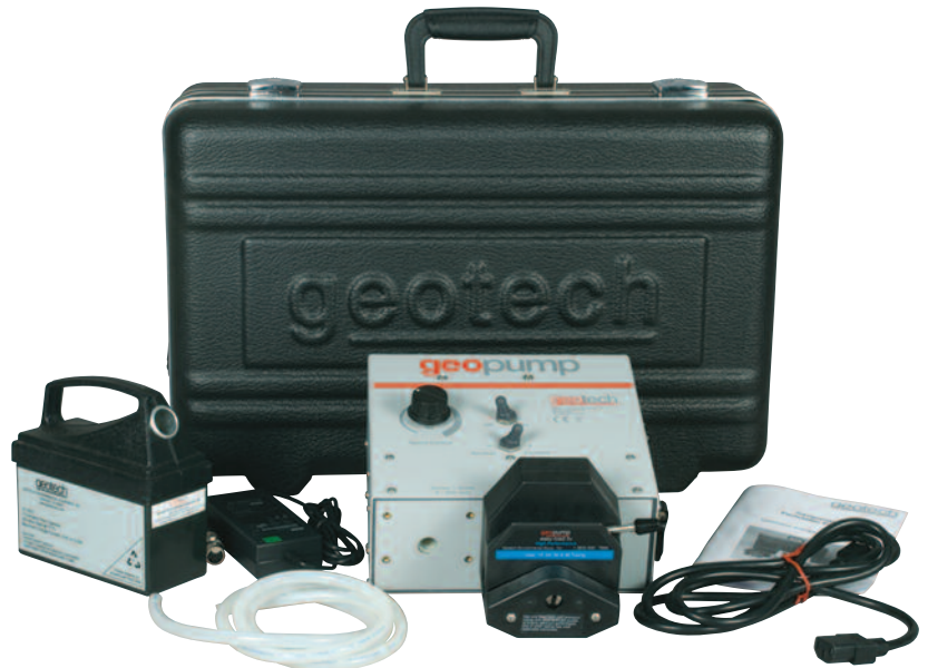
Geopump™ Peristaltic Pump Series II Kit with optional easy-load II® pump head, modular battery, 5 ft. (1.5 m) tubing, carrying case and power cord