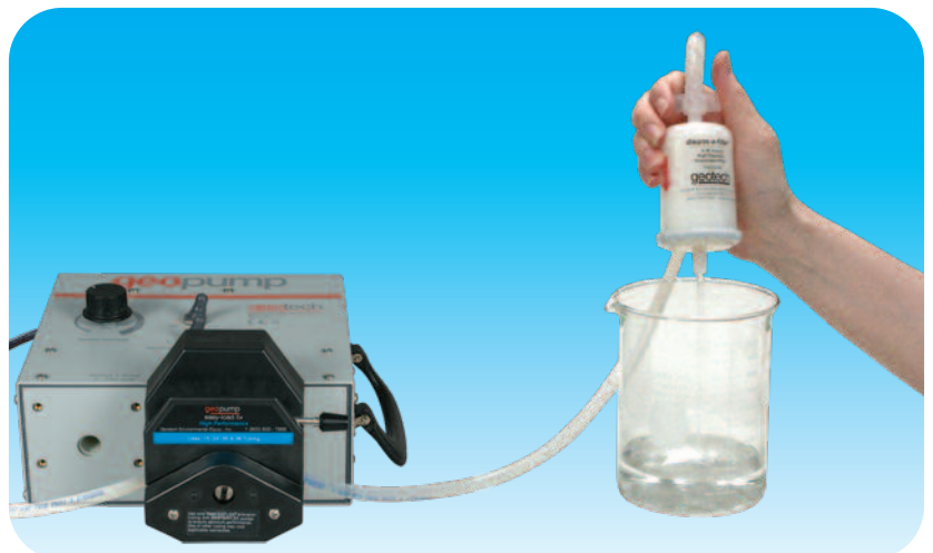
Sample collection with the Geopump™ Peristaltic Pump Series II with optional easy-load II® pump head (dispos-a-filter™ capsule sold separately)