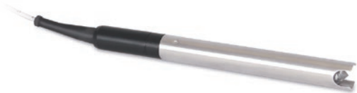
Model 122M P8 Probe

The 122M uses the P8 Probe, which is 5/8" in diameter (16 mm) and stainless steel. It is pressure proof, up to 500 psi. The beam is emitted from within a Hydrex cone-shaped tip. The tip is protected by an integral stainless steel shield, and is excellent for the vast majority of product monitoring situations. A cleaning brush is included with each Meter.