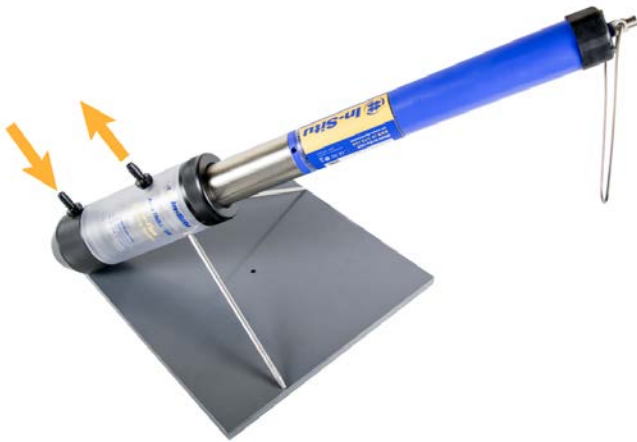
Aqua TROLL 600 Low-Flow Kit

Low-Flow Sampling equipment is used to direct the flow of water past water quality sensors during purging and low-flow sample tests. The seal between the instrument and the flow cell prevents water oxygenation prior to analysis. The 3-way intake valve can be used to divert flow for sample collection. The anti-siphon check valve prevents back flow at the outlet. The system accommodates 3/8" and 1/4" tubing, which is not included.