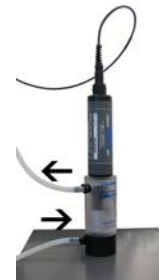
Aqua TROLL 400 Low-Flow Kit