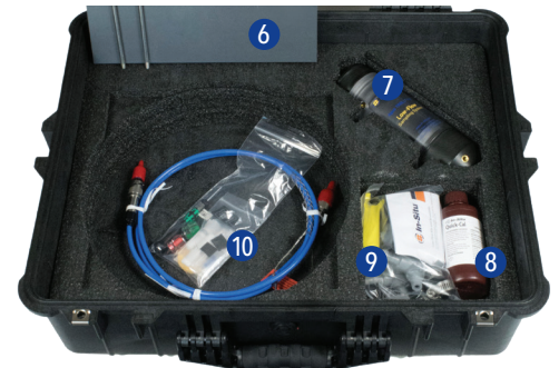
6) Base plate; 7) Low-Flow Flow Cell; 8) Quick-Cal Solution 9) Fittings kit; 10) Tefzel Rugged Cable