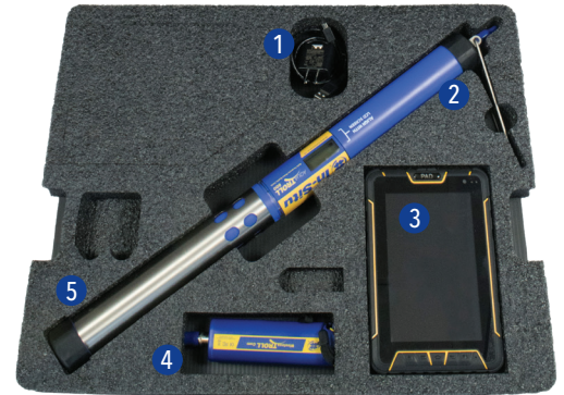
1) Micro USB charger for Android tablet and Wireless TROLL Com; 2) Aqua TROLL 600 Multiparameter Water Quality Sonde (batteries included); 3) Android tablet w/ VuSitu App; 4) Wireless TROLL Com with carrying case and belt clip; 5) Integrated calibration cap